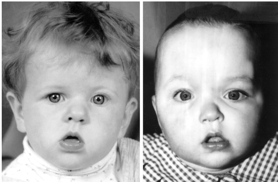
FIG. 1. Synostotic frontal plagiocephaly caused by FGFR3 Pro250Arg mutation. (left) Patient 1 and (right) patient 2. Both have first-degree orbital hypertelorism.

UCS, unilateral coronal synostosis; BCS, bilateral coronal synostosis; SCS, Saethre-Chatzen syndrome; CFNS, craniofrontonasal syndrome.